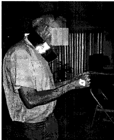
Figure 1. Shielding During Field Dowsing: Dorsal Neck Shield on Dowser #2

Here the research design was similar to one setup used by Harvalik where he buried a circuit under the soil or rather used damp soil as part of his circuit that included electrodes buried in the ground, and the dowser had to determine when the circuit was hot (energized). In other setups, Harvalik radiated dowzers with low power beams of various frequencies, and the dowzers had to detect (dowse) when the beam was on. In the present study, the field dowsing consisted of locating two branches of a simple DC electric circuit hidden beneath a 15 foot long carpet; the dowser walked back and forth each time to verify whether or not the direction of movement of the dowser relative to the circuit and relative to the position of the positive and negative pole of the circuit had any effect on the response. The circuit consisted of a 9V battery in a battery holder, 5 dual crocodile connector leads, a switch, and one LED—but unlike in Harvalik’s case, here the circuit was continuously on and the dowser simply had to locate where the “wire” was. Figure 1 and Figure 2 show dowser #2 performing field dowsing over the carpet and hidden circuit using L-rods and walking with a dorsal neck shield and crown shield respectively.