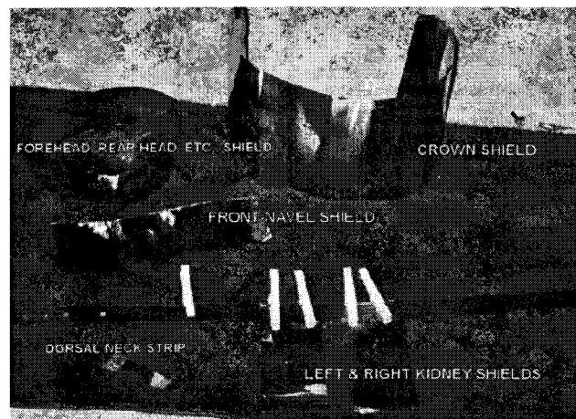
Figure 3. Mumetal Shields

It was cut into three 4 x 8.5 inch strips. These were attached to a leather belt using wooden pegs: two strips were suspended from the rear of the belt to cover the kidney area. One strip was suspended with pegs to the front center of the belt, to shield the front region at and below the navel. A fourth Mumetal strip 4 x 25 inches was folded into a circle, held in place with pegs against the dowser's skin, and used to shield the frontal and dorsal head, including the occipital ridge region. A fifth strip 8 x 25 inches shielded the crown and the back of the neck. A sixth strip 0.5 x 3.5 inches located the dorsal neck and crown regions more precisely. Figure 3 illustrates the shields used.